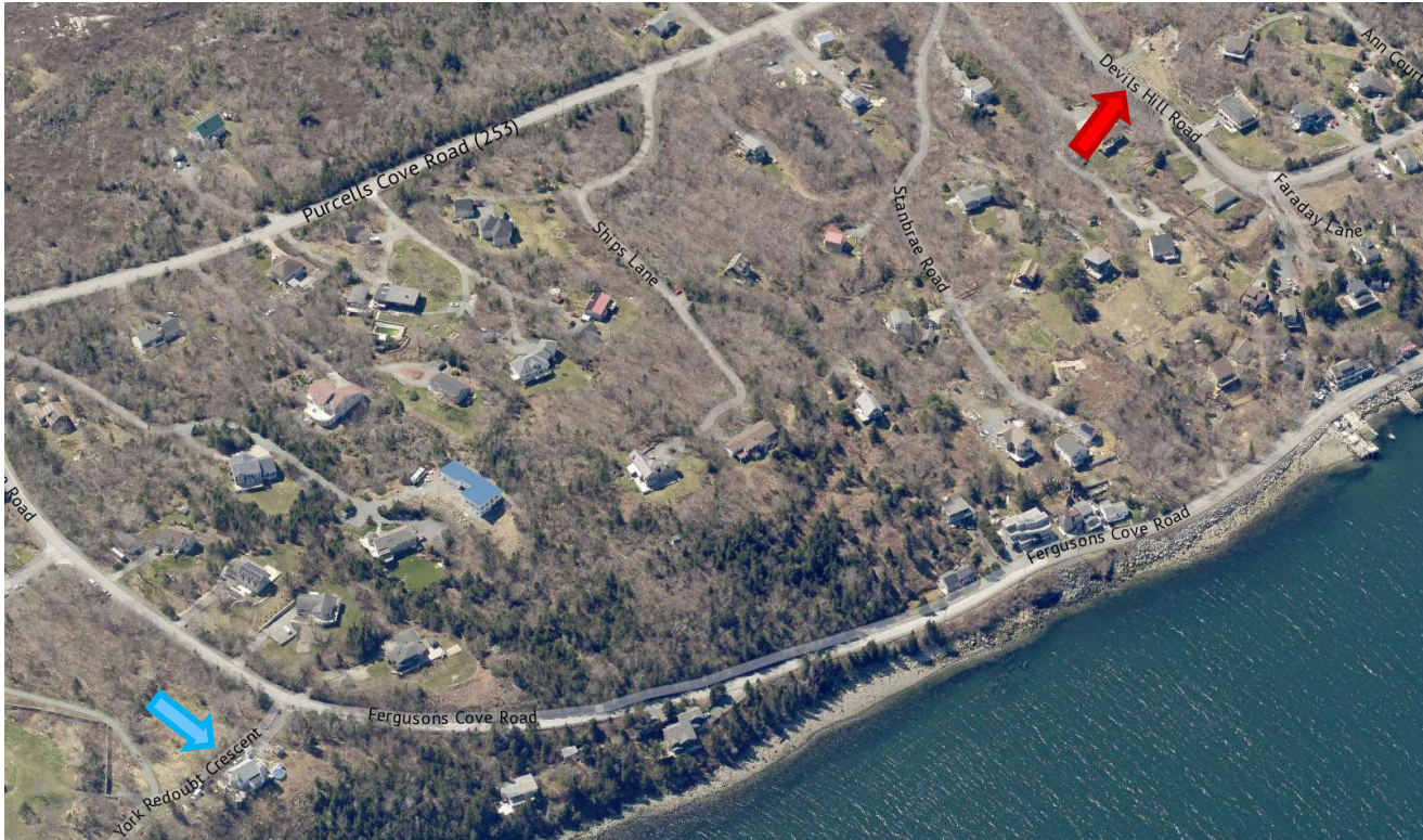
Aerial (2024) showing Stella Maris Church (blue arrow) and the local cemetery (red arrow).