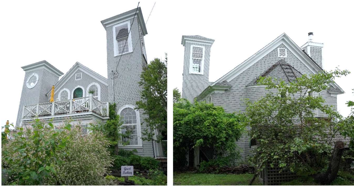
4 York Redoubt Cres, Ferguson's Cove "Stella Maris Church" (July 19, 2023)