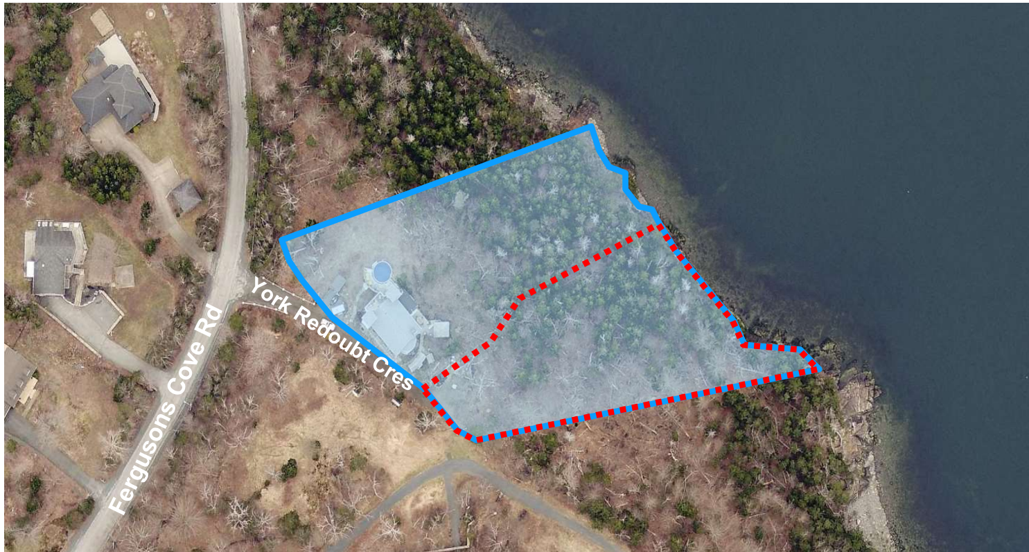
Approximate representation. Accuracy not guaranteed, see instead Attachment A – Plan of Subdivision