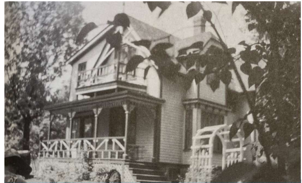
Red Gables circa 1935