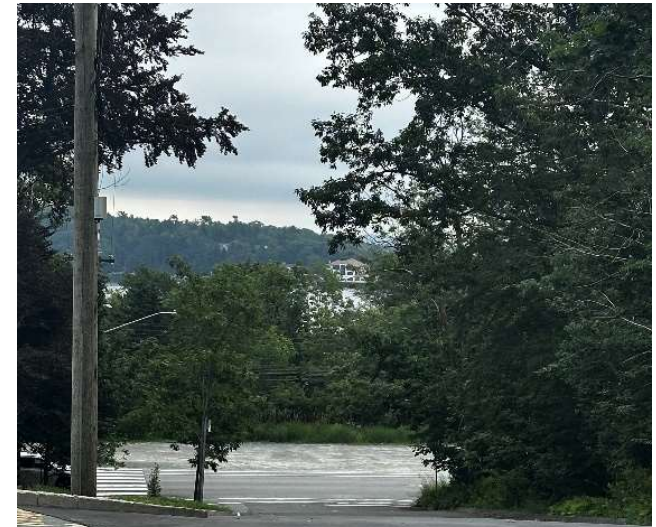
View of Bedford Basin near 8 Sullivan's Hill (July 2024)