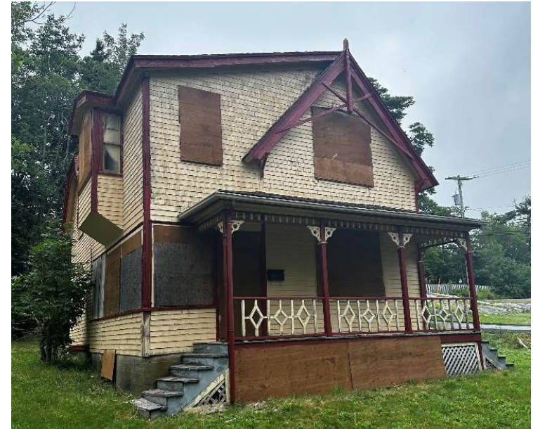
8 Sullivan's Hill (July 2024)