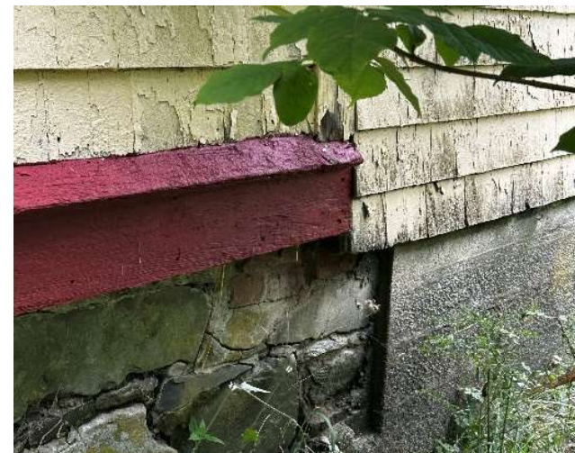
Stone foundation with concrete on addition (July 2024)