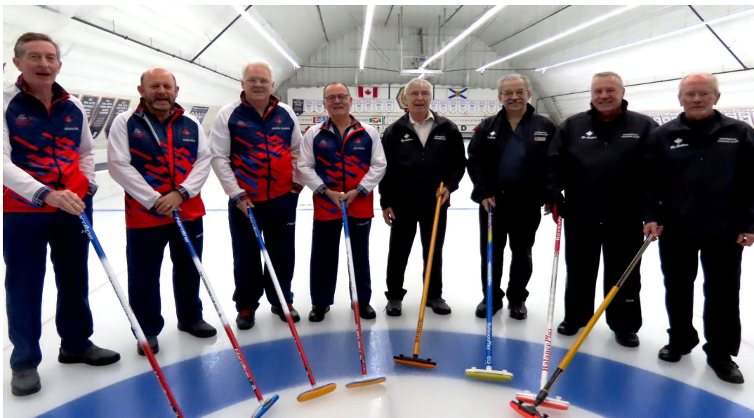
Figure 2-Senior Men, Dartmouth vs. Scotland in the Strathcona Cup

In Dartmouth's long winter months, where else is a senior going to find the "psychophysical benefits" – confidence, camaraderie, exercise, community – that membership in the curling club provides?