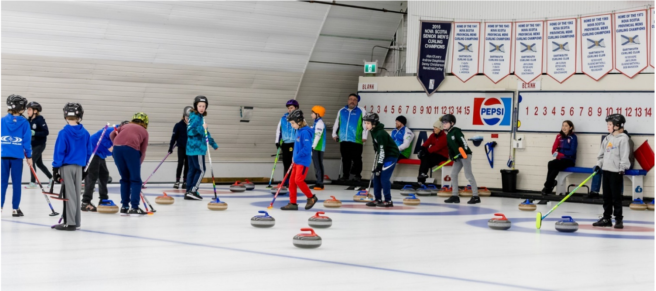
Figure 1-Junior Curlers in the Provincial U11 Tournament Hosted by the Dartmouth Curling Club