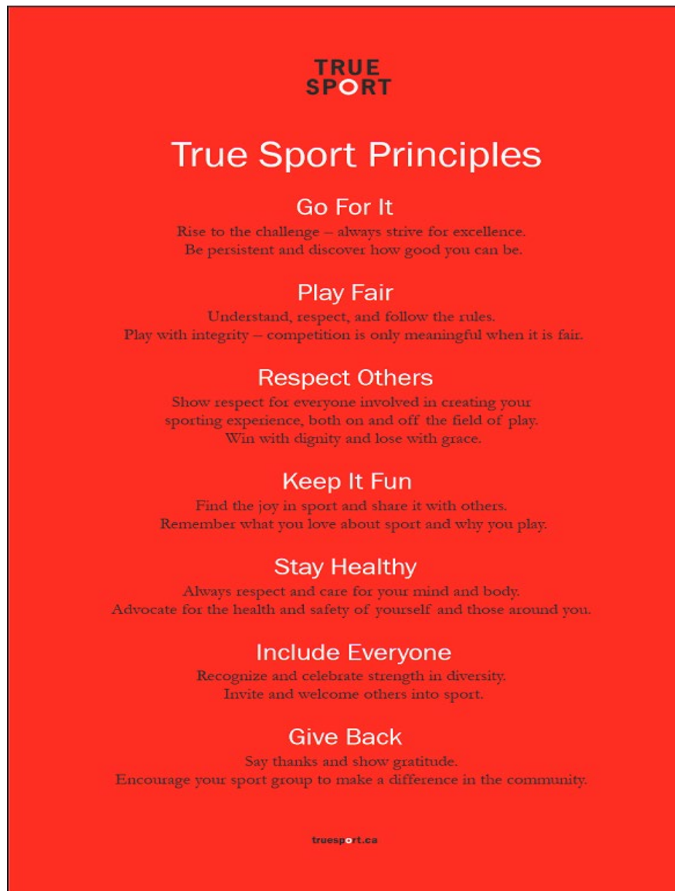
Figure 3-True Sport Principles

Curling is a sport of integrity, teamwork, athleticism, and intelligence. With a dedicated youth program developed over several years, our young members have thrived at the Dartmouth Curling Club. We subscribe to the True Sport principles: