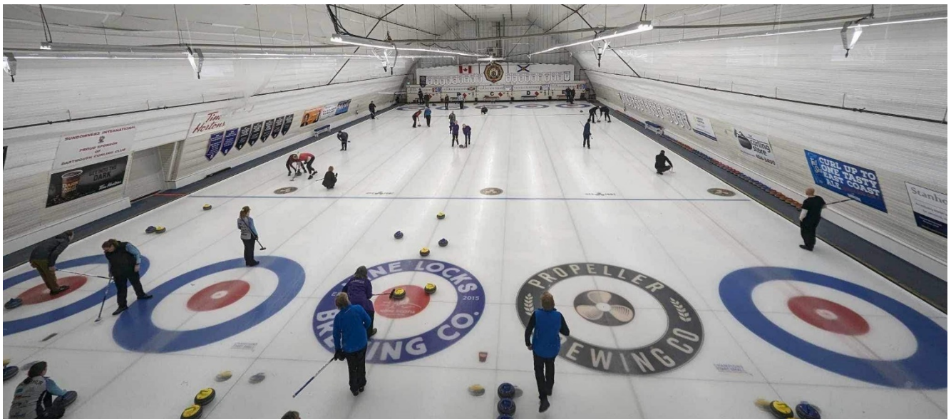
Figure 4-Competitive Curlers in our Club Championship

In short, the Dartmouth Curling Club matters to a whole raft of people and needs help to continue to provide this wonderful social sport.