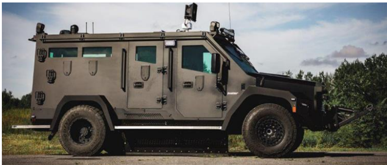
Terradyne Gurkha MPV: