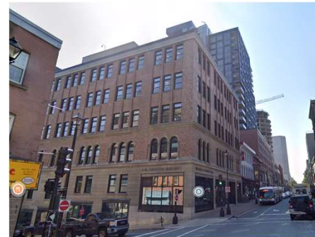
T. Eaton Store