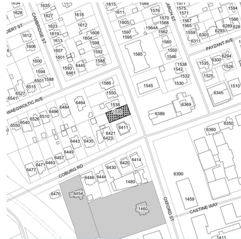
Location of 1530 Oxford Street