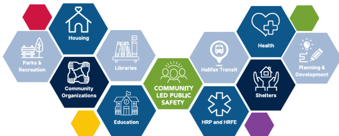
Figure 1: Community Safety Ecosystem

The municipality recognizes that prevention is core to its legislative mandate “develop and maintain safe and viable communities” 1 and has built the infrastructure to ensure that its approach to prevention can grow and thrive. This includes more than 15 years of foundational work and key milestones: