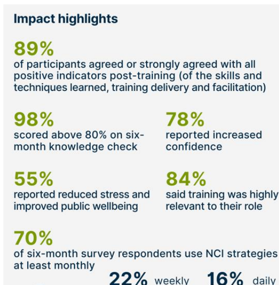
Figure 6: NCI Impact Highlights from an independent evaluation (see Attachment B)

CMT response mode to be more culturally relevant and consists of a community-based network of spiritual and mental health supports that are able to mobilize in the wake of a critical incident. CCRP led six rapid mobilizations this past year, ensuring timely and effective support for communities in crisis, demonstrating the impact and preparedness of the network. The CCRPs timely crisis response implementation fosters trust and emotional (peer) support in communities disproportionately impacted by violence.