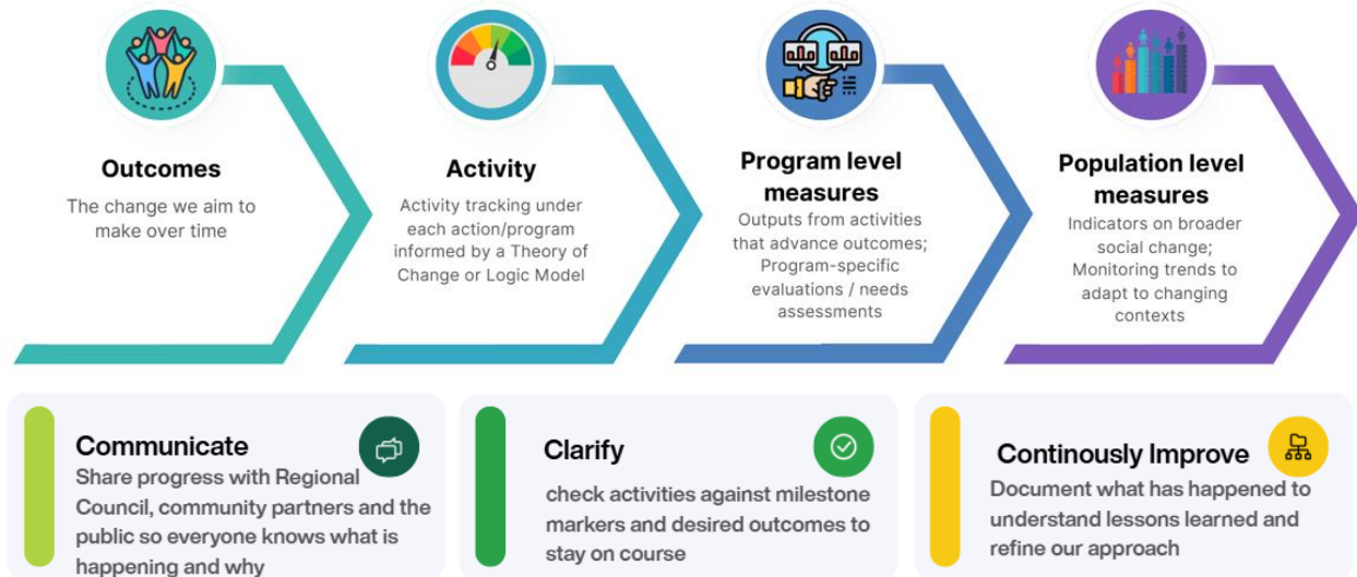
Figure 4: Public Safety Strategy Monitoring and Evaluation Framework

The remainder of this report captures key highlights from this past year’s implementation for each Strategic area of the PSS and a summary of challenges and next steps in Strategy renewal.