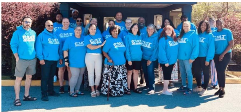
Figure 5: CMT members at a training retreat