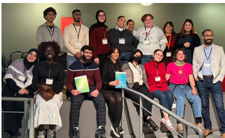
Figure 9: Youth PVE panel at the Canadian Centre for Safer Communities National Conference in Halifax 2025

conference that convened 155 participants including a delegation of youth for three days of learning and knowledge mobilization (see figure 10).