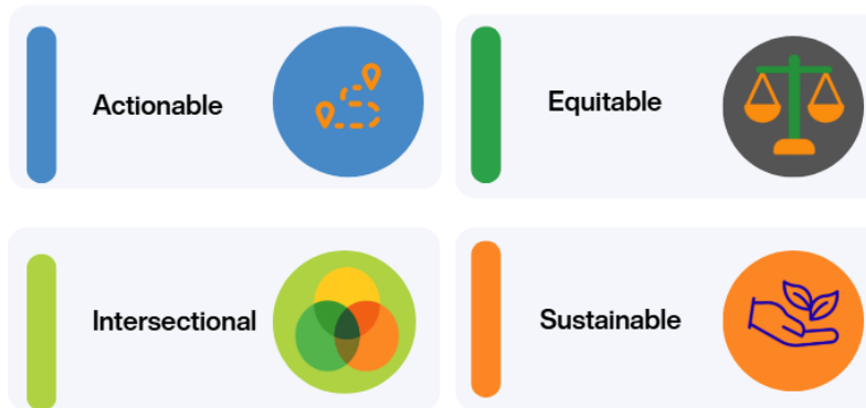
Figure 2: Strategy Guiding Principles