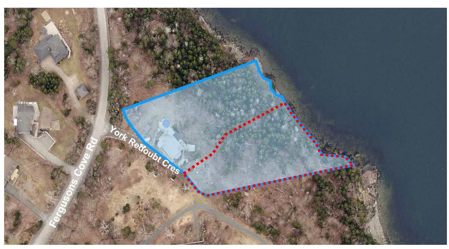
Approximate representation. Accuracy not guaranteed, see instead Attachment A – Plan of Subdivision