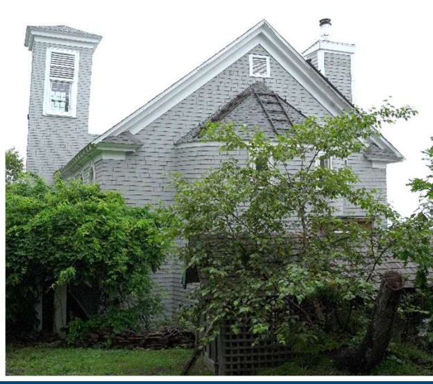
4 York Redoubt Cres, Ferguson's Cove "Stella Maris Church" (July 19, 2023)