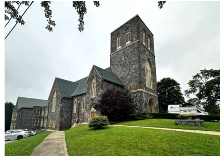
1300 Oxford Street