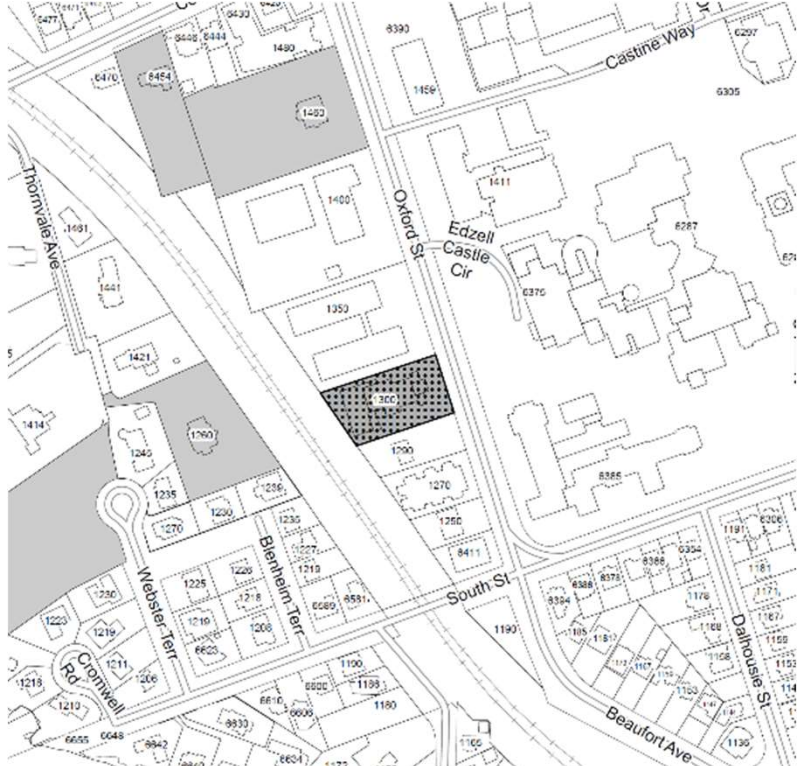
Location of 1300 Oxford Street