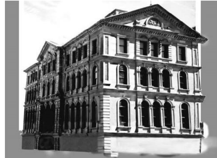
Old Post Office (Art Gallery of Nova Scotia built by Brookfield Construction Company