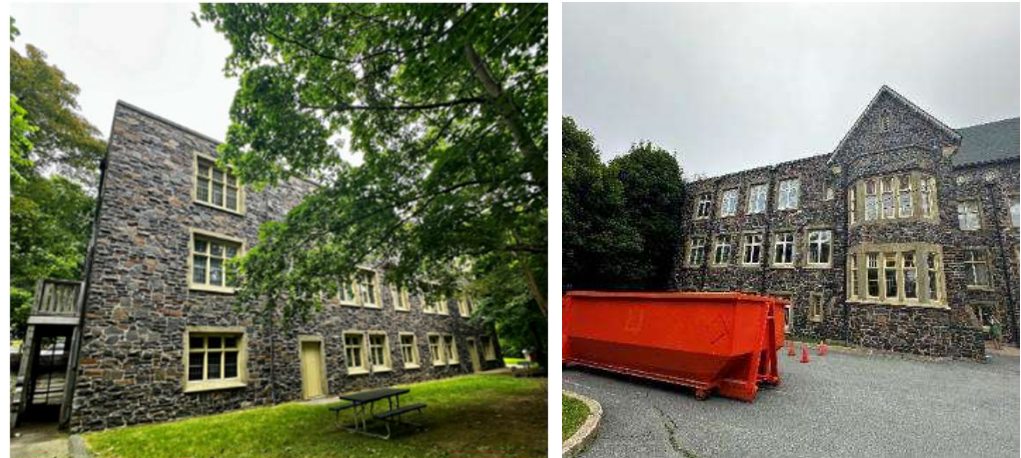
West and south elevations of the rear wing