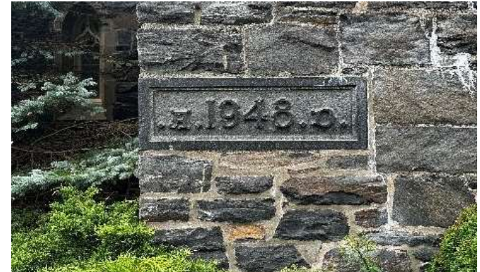
Cornerstone with 'A.D. 1948' Inscription

A rear wing was added to the church in 1958.